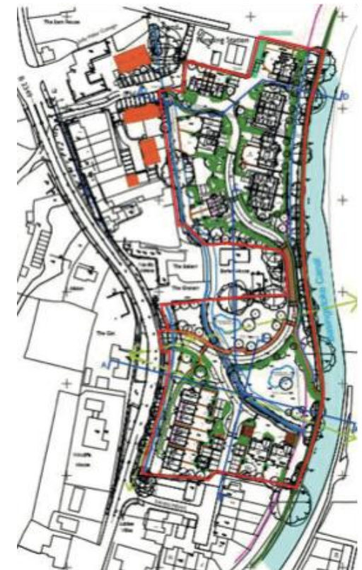
AFTER – 21 houses with a link road next to the canal and an opening onto a dangerous bend on Hook Road

Conservation areas – the site is in the North Warnborough and Basingstoke canal conservation area and SSSI (Site of Special Scientific Interest), surrounded by 17 listed buildings. The development does not enhance or conserve the area due to the urban nature of the proposed development.