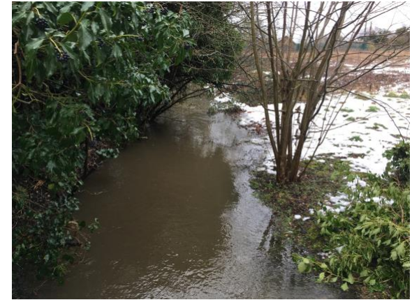
Flooding on the proposed development site Feb 2019- this month!

If you want to keep the rural setting of our beautiful village you need to act now .